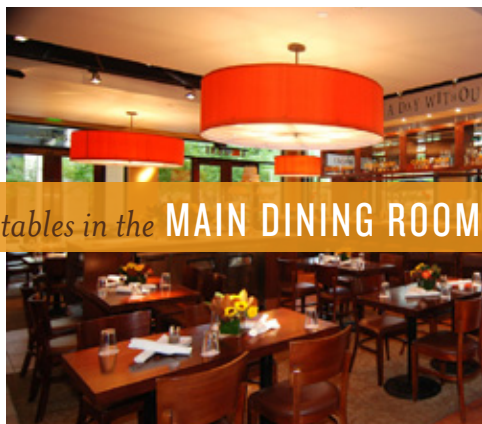
tables in the MAIN DINING ROOM